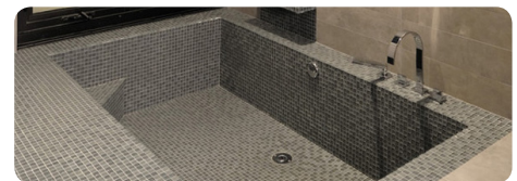
Waterproofing of sunken areas: Bathrooms, toilets, balconies etc.