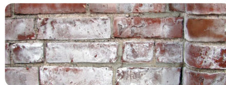
Masonry surface: Brick walls/concrete slabs subjected to damage from moisture/efflorescence