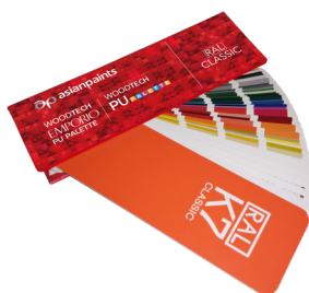
RAL SHADE CARD