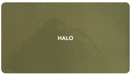
Tough Texture: Lasts long and ensures low maintenance