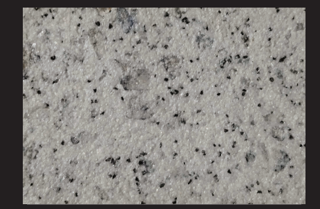
1A98O859325 LC Black