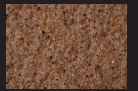
1A98O830330 GM Brown