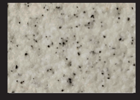
1A98O841330 GM Off White