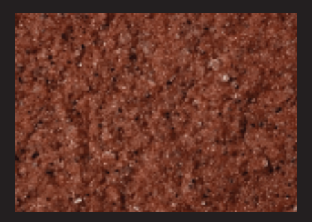
1A99O802330 Amara Red