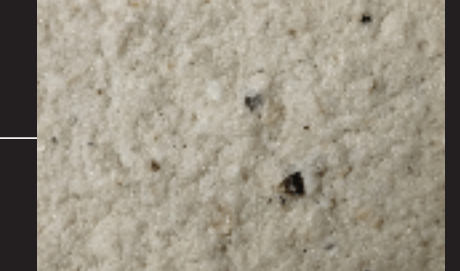
1A99O806330 Amara White