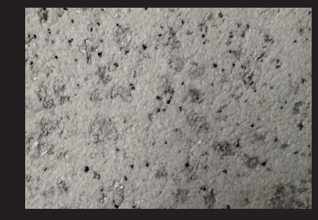
1A98O856325 LC White