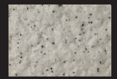
1A98O838330 GM white