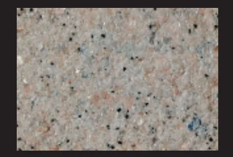
1A98O863325 LF Maroon