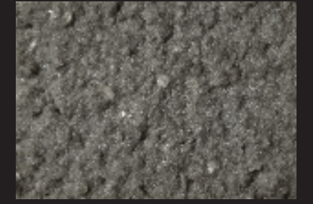
1A99O805330 Amara Grey