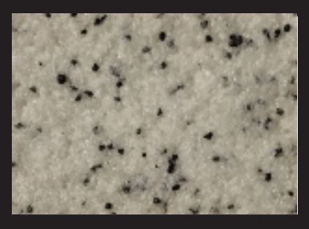
1A98O829330 GC Off white