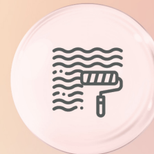
COLOUR STAY PRO