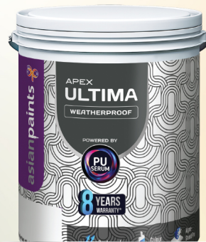
APEX ULTIMA WEATHERPROOF