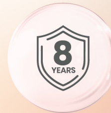
8 YEARS PERFORMANCE WARRANTY