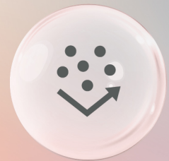
DUSTPROOF UV PROTECT