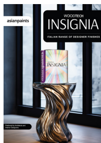
WOODTECH INSIGNIA BOOKLET