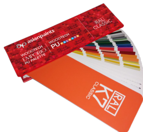
RAL SHADE CARD