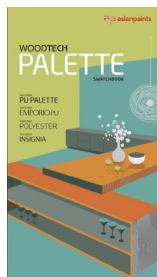
WOODTECH PU PALETTE SHADE CARD