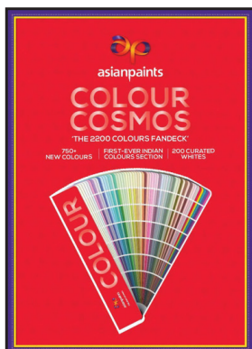
ASIAN PAINTS COLOUR COSMOS