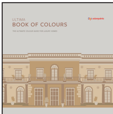
ULTIMA BOOK OF COLOURS (FOR HOMES)