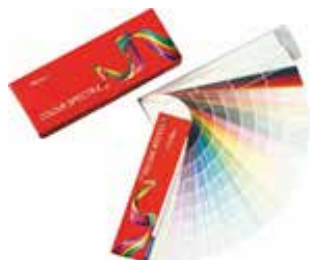
COLOUR SPECTRA FAN DECK*