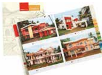
ASIAN PAINTS IMAGINE EXTERIORS