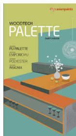
WOODTECH PU PALETTE SHADE CARD