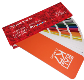
WOODTECH PIGMENTED FOLDER