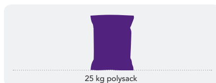
25 kg polysack

Shelf life: 3 years from date of manufacture in original tightly closed containers away from direct sunlight and excessive heat.