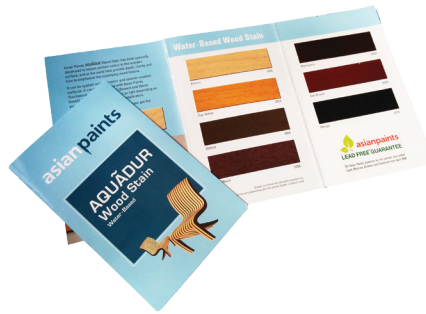
AQUADUR WOOD STAIN SHADE CARD