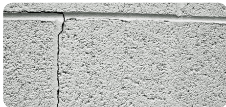
Exterior surfaces with plaster cracks upto 10mm