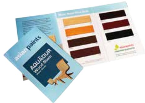
AQUADUR WOOD STAINS SHADE CARD