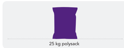
25 kg polysack

Shelf life: 3 years from date of manufacture in original tightly closed containers away from direct sunlight and excessive heat.