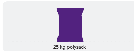
25 kg polysack

Shelf life: 3 years from date of manufacture in original tightly closed containers away from direct sunlight and excessive heat.