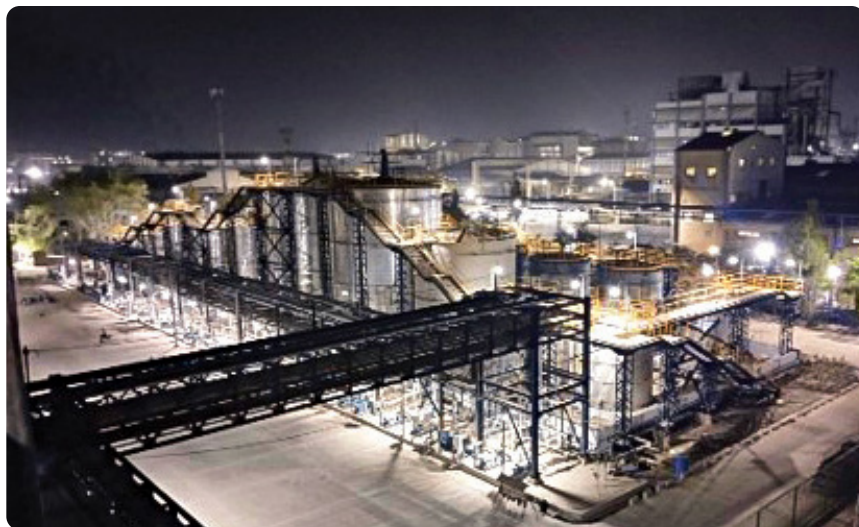
Night view of our Ankleshwar plant

Furthermore, we are currently working on developing new mobile applications to further enhance our customer experience. Read more on customer related apps in customer celebration on + Pg. 65