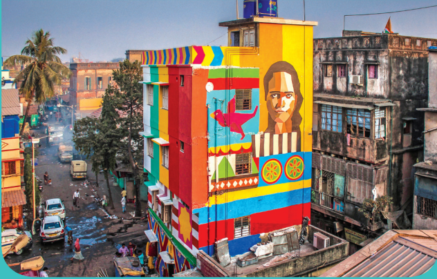
Kolkata - Sonagachi