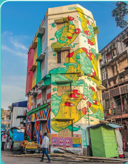
Kolkata - Sonagachi