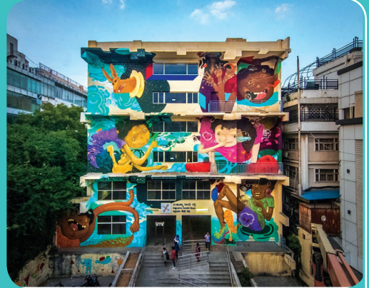
Bengaluru - MG Road Metro Station