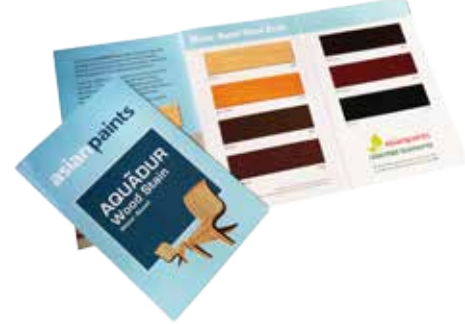
AQUADUR WOOD STAINS SHADE CARD